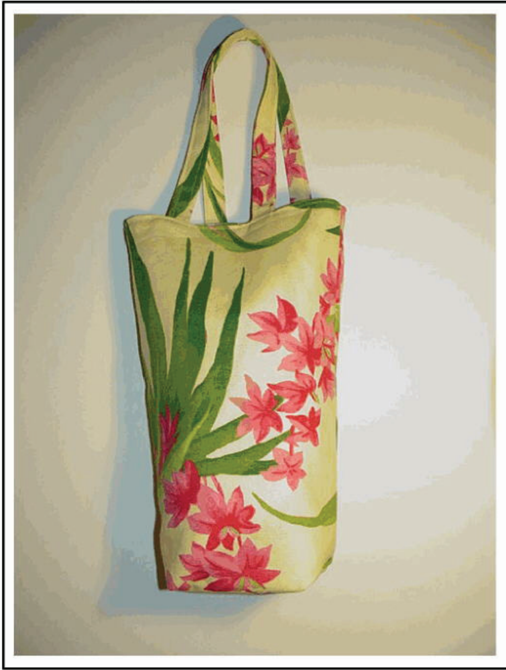
Bread Grocery Bag